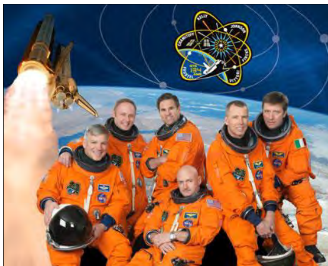
Pictured clockwise in the STS-134 crew portrait are NASA astronauts Mark Kelly (bottom center), commander; Gregory H. Johnson, pilot; Michael Fincke, Greg Chamitoff, Andrew Feustel and European Space Agency's Roberto Vittori, all mission specialists.

Yes indeed, in addition to loving everything and anything related to aviation, anything related to space carries the same fascination for me. Affordable tourist space travel may still be a possibility in my lifetime!